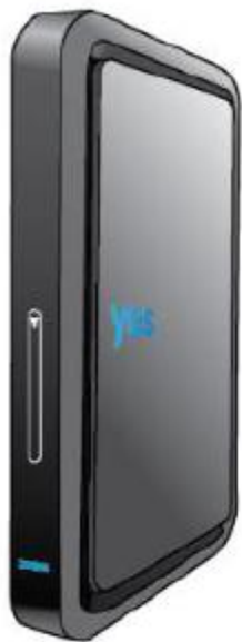
Zoom 4G Gateway